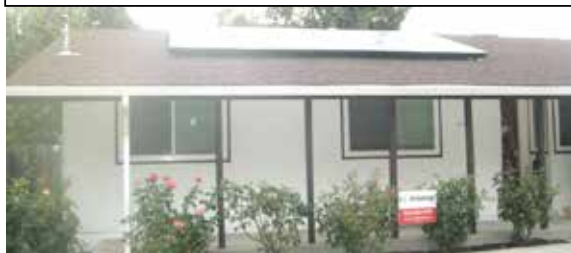
Customer on Sugarberry - 2014

Go Solar and get a REPOWER Smart Home Automation System installed for FREE ($899 value) Manage your Home's power usage automatically