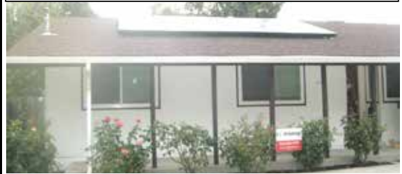
Customer on Sugarberry - 2014

Go Solar and get a REPOWER Smart Home Automation System installed for FREE ($899 value) Manage your Home's power usage automatically