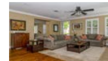
Bella, Concord — Pending! Represented Sellers