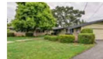
Elmwood, WC— Sold $975,000. Multiple offers, Sold over asking