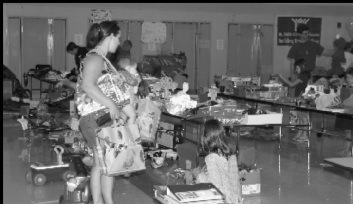
Shoppers loaded up at the VV Flea Market

In conjunction with the Annual Woodlands Garage Sale on October 2nd, Valle Verde held a "Flea Market for Katrina" in their Multi-Use Room. Faculty and parent volunteers were inundated with donations for the Flea Market. They spent hours pricing items and setting up. All proceeds will go to the Hurricane Katrina relief efforts. Thanks to all who donated items and volunteered their time! The total amount raised was not tallied by the time the newsletter went to print. We'll report the total in next month's newsletter!