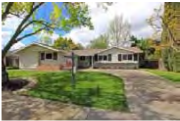
Pending Sale—3 Days