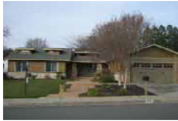
Pending Sale—5 Days