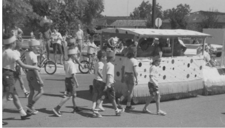
Woodlands children walk behind a float in the July 4, 1968 Woodlands parade. For more July 4th photos, visit www.woodlandsassn.org/woodlands_july_4th_parade.htm

Yes, it is coming up fast. For well over 30 years, our Woodlands kids have been decorating their bicycles, tricycles and wagons and parading from Valle Verde Elementary School to the Cabana Club. Neighbors will be lining the streets to enjoy the parade. Everyone in the Woodlands is invited to the Cabana Club from noon to 5:00 pm on the 4 th . Help your children decorate in red, white and blue streamers and get them to Valle Verde by 11:30 to be in our parade!