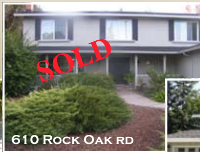
610 ROCK OAK RD

Thinking of Selling? Thinking of Selling?