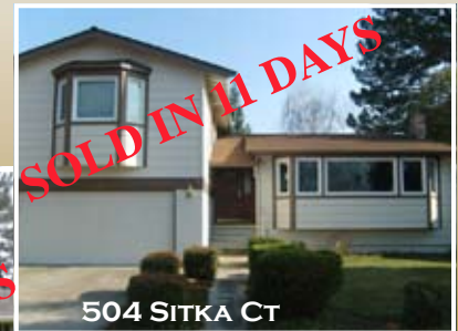
504 SITKA CT