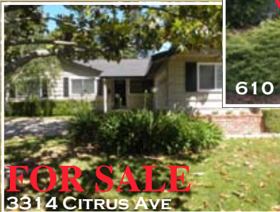
FOR SALE 3314 CITRUS AVE