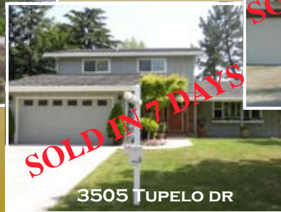
3505 TUPELO DR