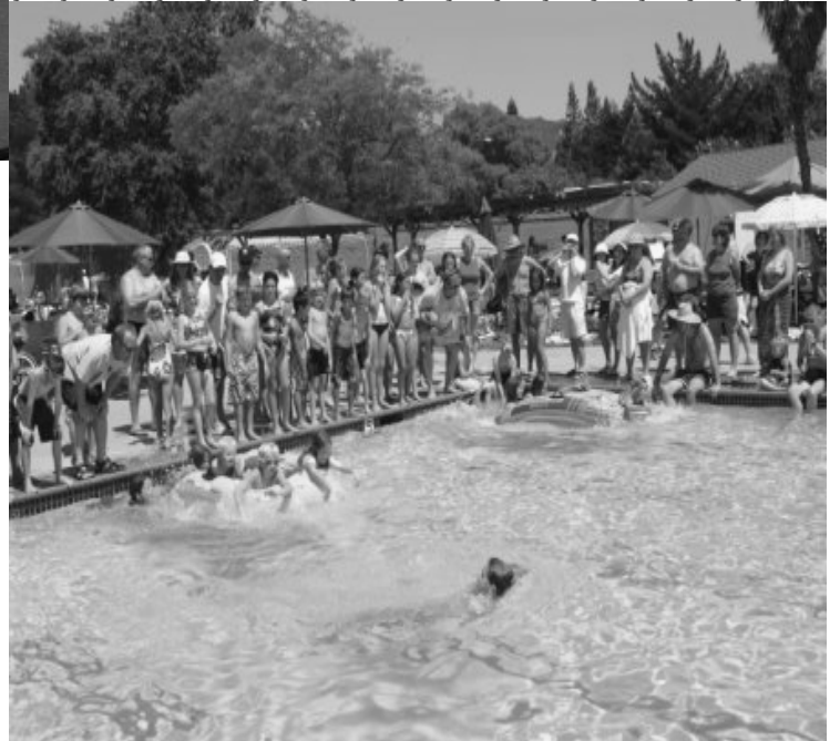
Raft races at the Cabana Club—2005

Everyone in the Woodlands is invited to the Cabana Club from noon to 5:00 pm. The club will be open for great games for the kids and great food for all on this special afternoon of making new friends and seeing old friends. What a great tradition! Games include the raft races, the pool coin toss and the candy toss.