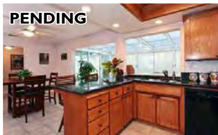
PENDING Clayton ~ 4 bdrm, 2 bath, 2,000 sq. ft. in lovely Dana Hills. Corner lot with sparkling solar pool, updated kitchen with granite counter. Dual pane windows. Sunroom added in '04 with permits, incl's wine bar, lets in plenty of natural light. Walk to historic DT Clayton. Offered at $465,000