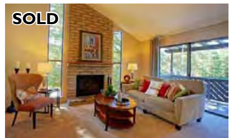
SOLD Pleasant Hill ~ 2 bdrm, 2 bath Fairway Place Townhouse with a bonus den. Soaring 14 ft. ceilings in living room and master bdrm. Floor to ceiling fireplace, front patio and back deck for entertaining and relaxing. New carpet, paint, light fixtures. Staged! Community pool. Offered at $275,000

Wishing all my clients the Happiest of Holidays!