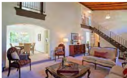
Walnut Creek ~ Lovingly maintained 4 bdrm, 2.5 bath, 2,056 sq. ft. Woodlands home. New carpet, vinyl, closet doors, dual-pane windows and paint-inside and out. 50 year tile roof. Cathedral ceiling and stone fireplace. Kitchen with break bar open to family room. 1st level incl's guest room/office with adjacent 1/2 bath. Lush backyard, mature trees - no rear neighbors. Walk to shops, schools & trails. Northgate H.S. Offered at $649,950

Call Today at 925-915-0960 or Visit www.Pronto-Maids.com for More information