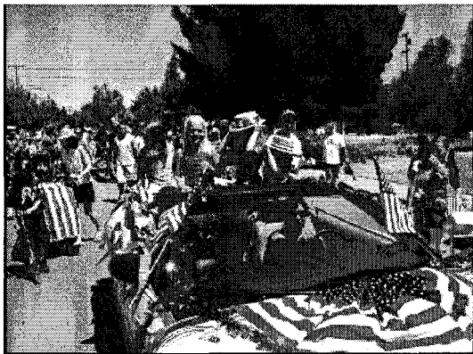
The 4th of July parade is our best tradition in the Woodlands

Thank you to all for another successful 4th of July Parade and Barbecue! This year's parade reminded me of something right out of a Norman Rockwell painting. There were pre-parties for decorating bicycles, scooters and go carts in the olè Red, White & Blue. Families gathering together, sharing stories of past parades, while children decorated for the big parade starting at Valle Verde. Winding its way through the neighborhood the parade, lead by the much anticipated big red fire truck, to the joy of the