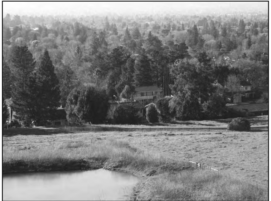
Open Space Pond needs TLC

Removing the black mustard plants, and any other exotic, invasive plants would make an excellent project for some Woodlands families or possibly a local girl scout or boy scout troop. The open space foundation is looking to us for help to take on the challenge to clean it up.