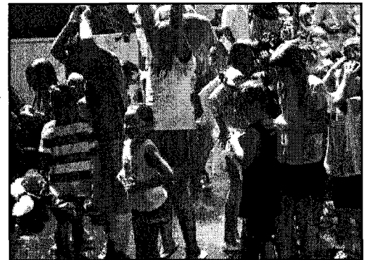
The Kids being sprayed with water at the parade

children & spectators along the way, ending at the Cabana Club with a big wet finish as the firemen cooled the children off with a real fire-hose! In the eyes of a child there is nothing quite like being sprayed by a real fire-hose. The barbecue and games provided a wonderful day that would not have been possible without the collective efforts by local friends, residents and families. Watching the children running around all day so excited and having so much fun made all the efforts worthwhile. A special thanks to all for their help and support.