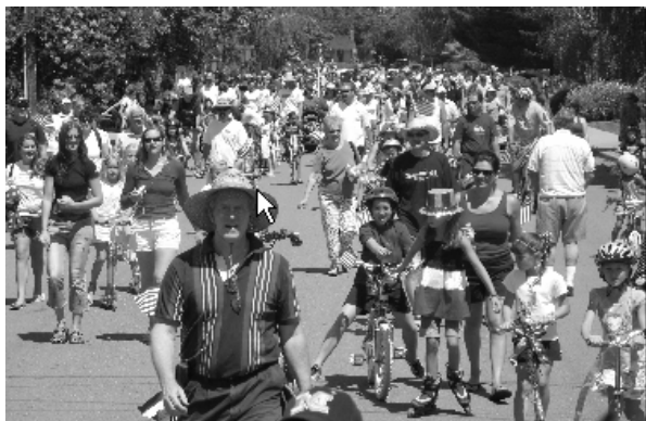
The parade well underway like to thank all of the residents that participated in making the 4 th of July Parade another

Children were excited and eager as they congregated in front of Valle Verde around 11:00am on the 4 th , showing off their patriotic decorations and complimenting each other on jobs well done. Soon the fire truck arrived and the parade was under way, a sea of red, white and blue making its way down Candleberry Lane towards the Cabana Club. Residents along the route cheered the best decorating jobs, and