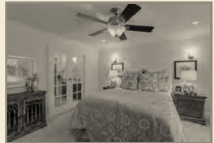
SOLD FOR $1,023,300. 659 Rock Oak, Walnut Creek 4 Bedrooms 2.5 Baths 2,404 sf