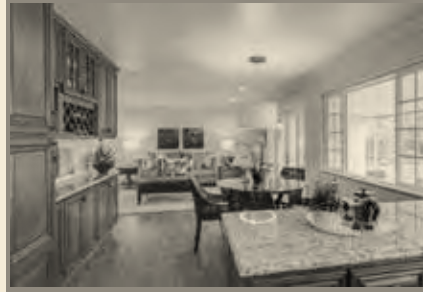
SOLD IN 8 DAYS OVER ASKING! 3648 Sugarberry, Walnut Creek 3 Bedrooms 2 Baths 1,602 sf