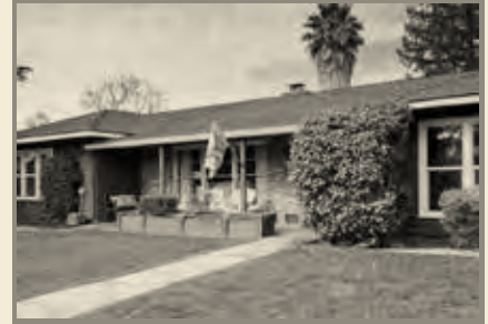
SOLD 124% OF LIST PRICE @ $900,000! 23 Marlee Rd. Pleasant Hill 4 Bedrooms 3 Baths 2,143 sf