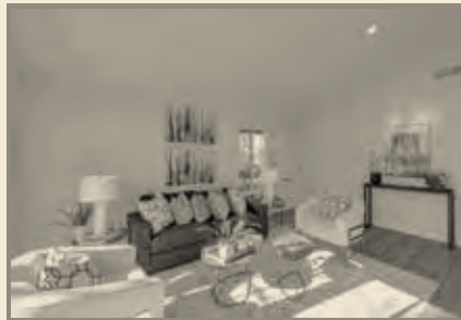
SOLD IN 8 DAYS, 105% OVER ASKING! 1200D Kenwal, Concord 2 Bedrooms 1 Baths 915 sf