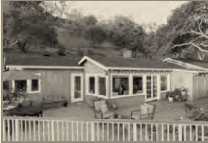
SOLD IN ONLY 14 DAYS @ $1,362,000! 3451 Echo Springs Rd. Lafayette 2 Bedrooms 2.5 Baths 2,216 sf