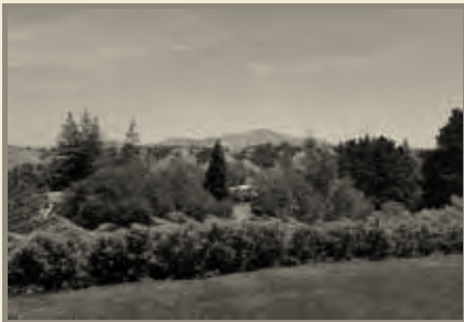
SOLD IN ZERO DAYS @ $790,000! 3266 Ptarmigan, Walnut Creek 2 Bedrooms 2 Baths 1,521 sf