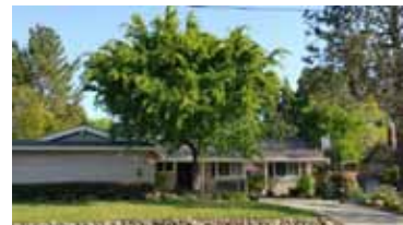
Peachwillow — Pending!