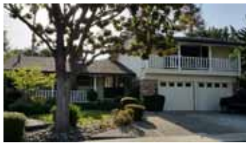
Stonehaven — Sold $910,000.