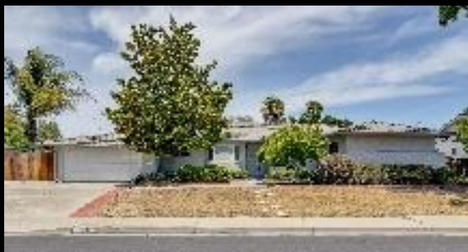
2234 Gill Port Lane, Walnut Creek Offered at $759,000 ACTIVE