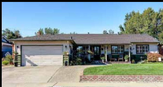
4626 Brenda Circle, Concord Offered at $575,000 PENDING